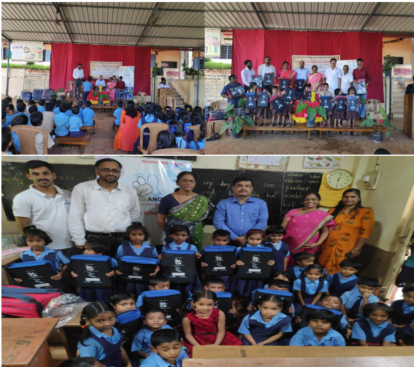
210 Deskit bags were distributed in 3 Different Schools for the needy Children